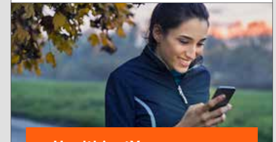
HealthiestYou By Teladoc®

Tired of waiting rooms and office copays? Save time and money with the convenience of virtual visits. The HealthiestYou app provides 24/7 access to a network of doctors ready to diagnose and prescribe treatment for many common illnesses right over the phone. You can also locate providers and shop around for the best prescription prices in your area. Note: HealthiestYou is not insurance.