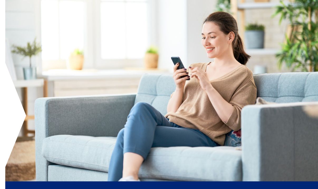
Guard's extra benefits are nothing to sneeze at

Note: The Optum Perks card is not insurance. It is a discount program only and available to the general public.